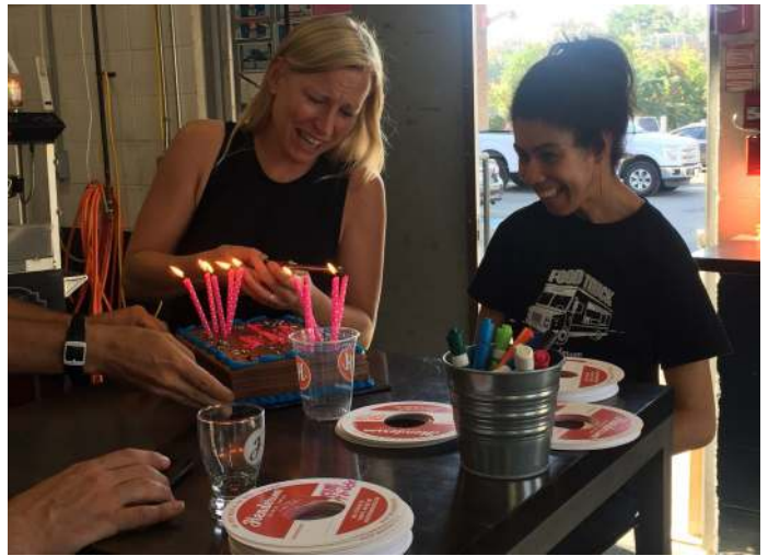
Staff at Henderson's and Klicia L. take a break and celebrate the special occasion with a top favourite—chocolate cake.

Cheers to all the staff at Henderson who help make community inclusion not only possible but beneficial for everyone—the staff, participants and the community.