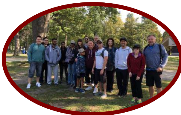
Out for our annual Sunday morning 5K Walk in the Park!